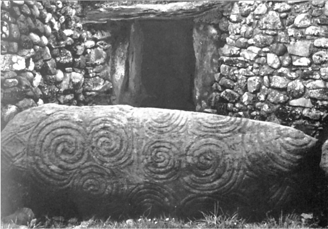
Stone Age obelisk with two vortices spinning in opposite directions.

a man in a black robe with purple sashes. I think at that time, I recognized that he must've been some kind of a monk, and later realized it was a Tibetan Lama. He handed me a box, clearly a treasure chest, but a small one. He said, "Here, I give this to you. Take it into the other room." I opened the door and noticed there was a safety deposit box there. I opened the safe and put the treasure chest in there, and locked it. I returned to the first room and the Lama nodded to me. That was the end of the dream. Many, many years later, I met a Tibetan Lama and I told him about Somatic Experiencing, and asked him if that was consistent with any of the Tibetan healing traditions. He said, "Yes, definitely. There's a lot of things that are in common with the Kum Nye tradition," which is an embodiment-centered approach. I didn't know it at the time.